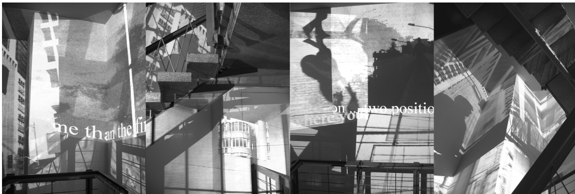
Figure 1. Images of Trigger installation at Pace Digital Gallery.

Two examples of digital art will be discussed from the perspective of an installation that would be part of an exhibition five hundred years in the future. This is not an unreasonable expectation given that five century old paintings by Leonardo, Raphael, Titian, and Bellini grace the walls of major art museums throughout the world. And through a combination of the original artist's craftsmanship and conservation science these works will most likely have an equal or better chance of being displayed at the same future time as this digital work.