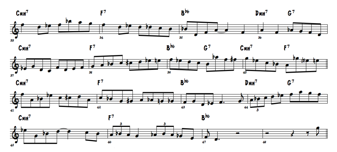
Figure 4.24 Fats Navarro's solo on "Leap Here" ms. 33-48

This nearly sixteen-bar phrase begins his second chorus on "Leap Here." The line begins with the "Cool Blues" quote in measure 33 followed by a chromatic descent from the third to the root of Bb Ionian major in measure 35. The chromatic descent leads to a four-note chordal outline of Bb major seven in measure 35. He outlines the turnaround (secondary dominant harmony) in measure 36 utilizing the flatted ninth over G7 followed by a segment of the dominant bebop cliché (as shown in Figure 4.18) on beats one and two in measure 37. He continues with the 2-7-1-2 digital pattern on beats three and four of measure 37 followed by a four-note diatonic ascending scale fragment on beats one and two of measure 38. Instead of chromatically descending as in the previous half of the "A" section, he ascends chromatically on beats three and four in measure 38 starting from lowered third (Db) leading him to the 5<sup>th</sup> scale degree of the tonic. Measures 37 through the beat two of measure 39 are based in a Bb Ionian tonality rather than outlining the ii7-V7 progression illustrating Navarro's use of harmonic generalization of the chord progression.