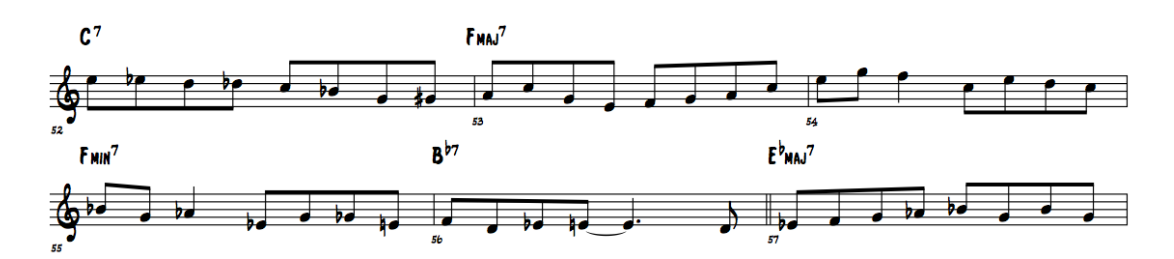
Figure 4.12 Fats Navarro's solo on "Ornithology" ms. 52-57

A final look at Navarro's use of combining these different enclosures is illustrated in measures 52-57 on "Ornithology":