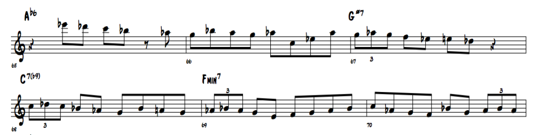
Figure 4.11 Fats Navarro's solo on "Lover, Come Back to Me" ms. 65-70

The first occurrence appears on beats one and two of measure 66 and the other on beats three and four in measure 68. Although both examples contain the same pitches in different octaves, they serve a different harmonic function over the harmony.