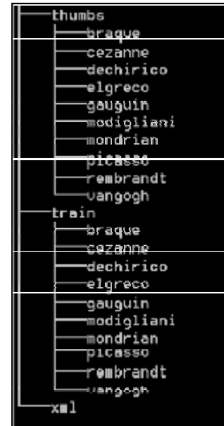
Figure 1. Directory structure for IIR system database.

per artist. Every image added to the database is copied into the appropriate artist subfolder in the train directory and a resized small version of the file is copied into the artist’s thumbs directory. The xml directory contains the index files required to maintain the integrity of the directory structure and to manage the data extracted from the images. The design supports student needs for simple access to data and ease of data distribution.