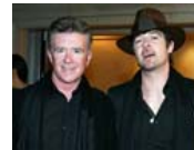
Father and Son