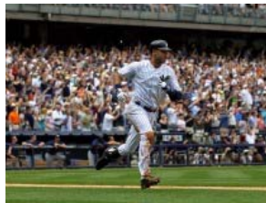
DJ3K Photo Gallery