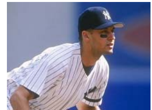
Milestones & Memories