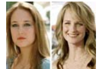
Separated at Birth