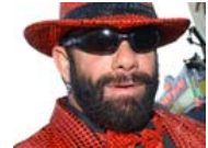
Notable Deaths 2011