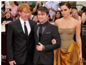
Harry Potter Premiere