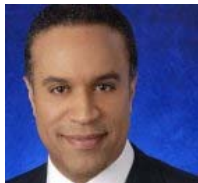
Reporting Maurice DuBois

Some even strap on leg weights to slow them down and wear bulky gloves to perform everyday tasks. Others have used popcorn kernels in their shoes to simulate the pain of aching feet.