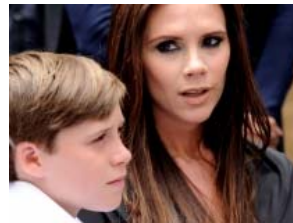
15 Bizarre Baby Names