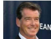
Sexy In Their 50s